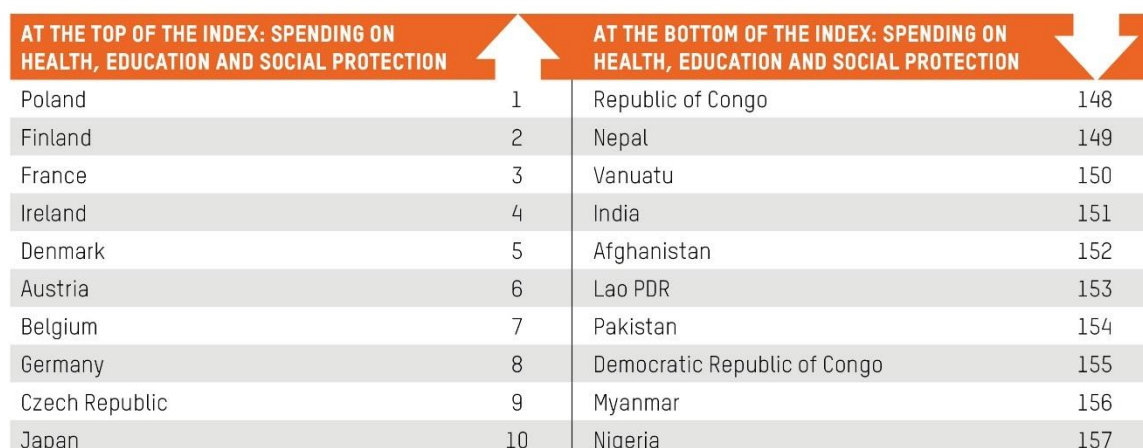
Table 3: CRI Index ranking on spending – the top and bottom ten countries

Some countries are using social spending as a means of redistributing wealth and income, and this is having a significant impact on inequality. Near the top of the rankings for the spending pillar are two broad clusters of countries. First, there is a cluster of high-performing OECD countries: renowned for their well-established, long-term commitments to publicly funded social investments, this group includes Finland, Germany and Denmark. 138 Second, there is a group of high-spending (and high-income 139 ) countries in Latin America.