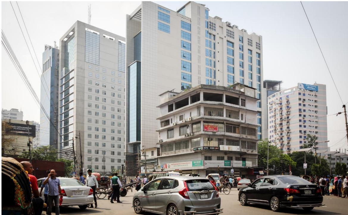
The financial district of Dhaka, Bangladesh. Despite economic growth, almost 40 million people in Bangladesh still live below the national poverty line.